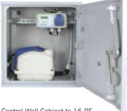
Control Wall Cabinet to 16 PE