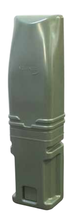
* Optional Elements | All parts can vary in shape and colour.